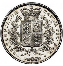
'Bull' - Crown (5s or 5/-)